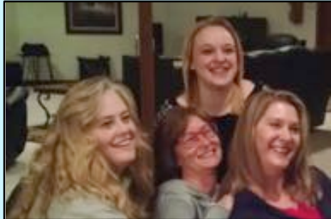
The Jack Pot Winners!!

The Rock Jocks of Patrol 3 have remained busy busy, although the recent weather has made it difficult to enjoy the trails together regularly, we keep the comradery going by enjoying Patrol 3 Poker Nights, Pot lucks, and lots of fun and laughs (with a couple of the Lady Rock Jocks "Taking the Pot"), no fear for the other Rock Jocks redemption is right around the corner with round 2!