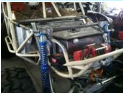
Rattler Gets some Pep in his Step! These pictures show the 2.5 inch KING coil over's that replaced the ORI shocks. The buggy was built as an ultra 4 race buggy. At high speeds the ORI shocks are totally awesome, but were found to be extremely difficult to tune for trails that patrol 3 runs.

Many of the Rock Jocks continue working on upgrades and mods, with big plans for trying them out during many of the up and coming runs and trips! Check out some of what these Rock Jocks will be sporting this spring!!