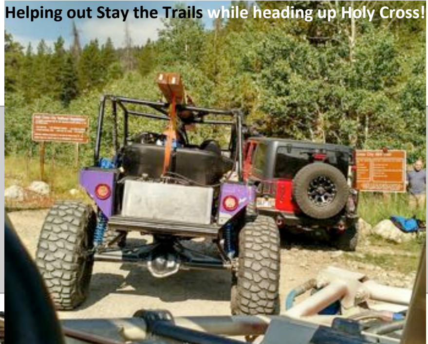
Helping out Stay the Trails while heading up Holy Cross!