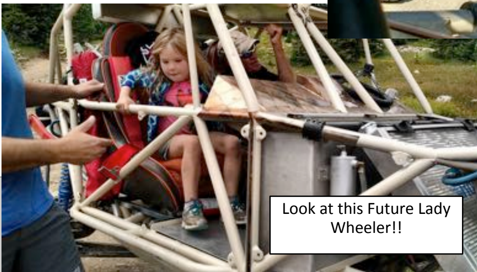
Look at this Future Lady Wheeler!!